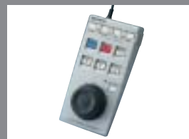
DSRM-20 Remote Control Unit